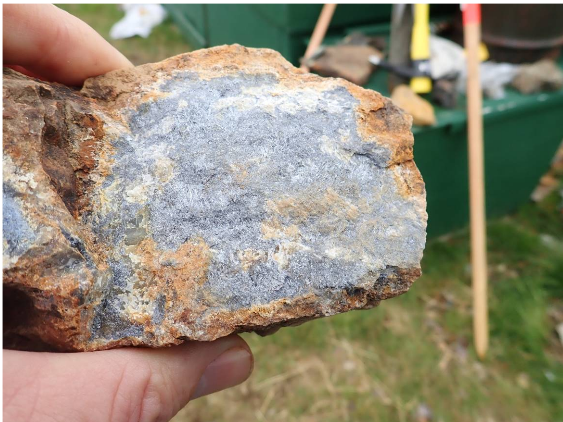
Figure 3. Massive stibnite sample from Gemuk (GMR030, 2.56g/t Au, Sb>10,000ppm).