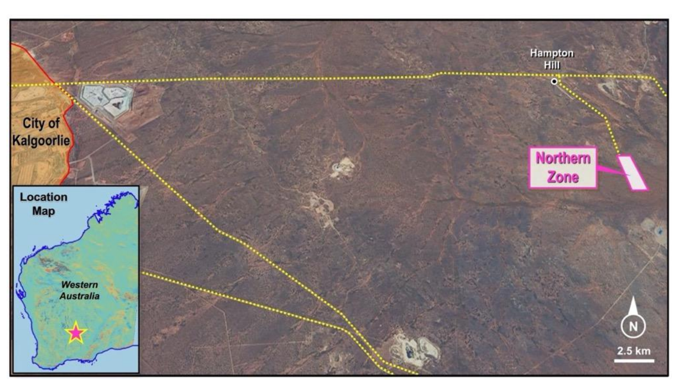
Figure 2: Northern Zone Project Map showing proximity to the Kalgoorlie "Super Pit".