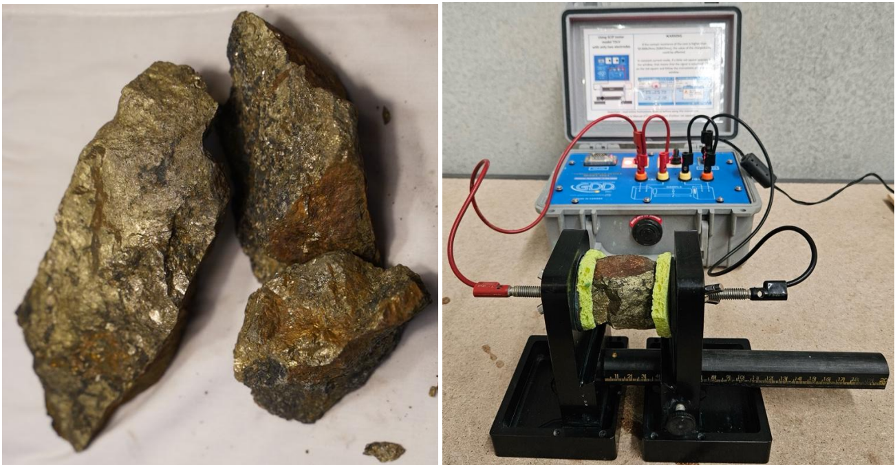
Figure 1: Prince Of Wales prospect sample RK008302 10.15% Cu and 65.8g/t Ag 2 , being tested for Induced Polarisation, chargeability, galvanic resistivity and inductive conductivity

The results of the petrophysics indicate that Drone MMT could quickly assist with defining new targets and prioritising existing targets by broader coverage, deep resistivity mapping, with the option of more focussed ground Induced Polarisation/Resistivity surveying over defined priority MMT targets defined.